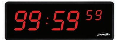
Surface-Mount Timer Kit

* Digital Clock needs to be purchased separately, retrofit existing LEVO clocks