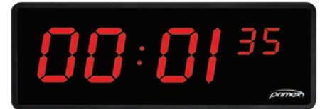
Code Blue Timer Kit

* Digital Clock needs to be purchased separately, retrofit existing LEVO clocks